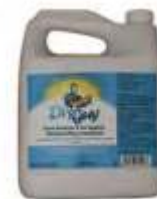
Horse Blankets & Pet Apparel Waterproofing Concentrate