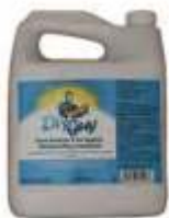
Outdoor Gear Waterproofing Concentrate

LEADER IN MANUFACTURING ENVIRONMENTALLY FRIENDLY BREATHABLE WATERPROOF PRODUCTS. DESIGNED FOR WATERPROOFING HORSE BLANKETS AND MANY OTHER APPLICATIONS.